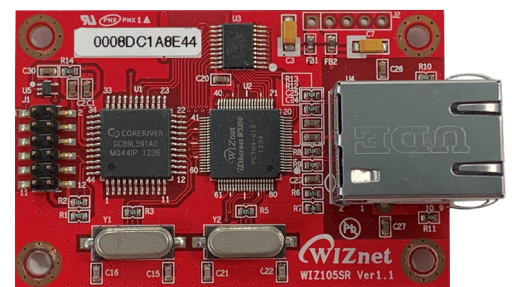
onAER Communication Kit - P/N 69154