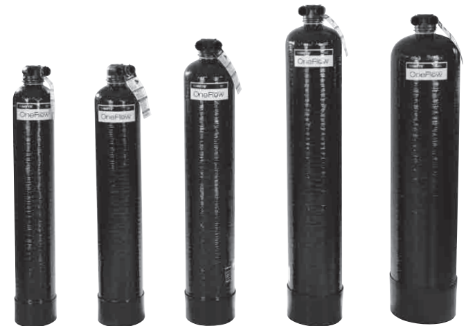
OF744-10 OF844-12 OF948-16 OF1054-20 OF1252-30

* For hot water applications where water temperature is 110°F – 150°F (43°C – 66°C), please consult ES-OneFlow-HotWater