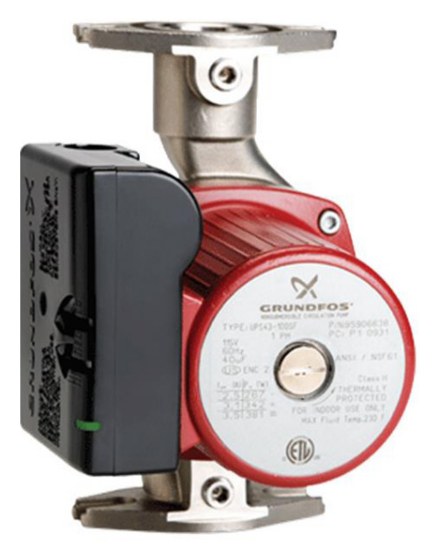
Actual pump may vary from illustration