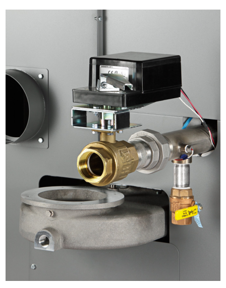
Valve Packaged on the Innovation Unit

The following chart illustrates how multiple Innovation heaters with WHM compare with the two most common alternative system designs: 1) storage tank heaters and 2) hot water supply boilers packaged with external storage tanks.