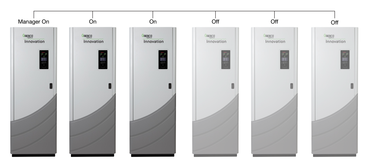
System Efficiency for Domestic Hot Water from the leader in Condensing Firetube Designs.

The AERCO Innovation line of high performance commercial tankless water heaters features Water Heater Management (WHM) standard onboard the Edge [i] Controller. WHM is the only sequencing control that truly addresses two key water heating system performance issues: cycling and standby losses. This feature guarantees that an installed system of multiple Innovation heaters: